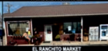
EL RANCHO MARKET