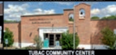
TUBAC COMMUNITY CENTER

To: Postal Customer Attention Post Office: OFFICIAL TIME SENSITIVE MATERIAL