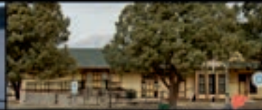
PATAGONIA TOWN HALL