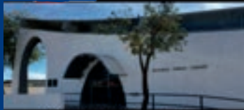
NOGALES PUBLIC LIBRARY